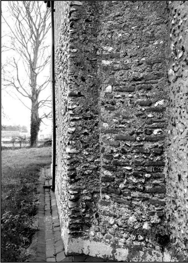
Photograph 2. North-west corner of the nave where it abuts onto the tower, showing the flint quoins of the Saxon wall of the nave and the fillet of brick and flint bridging the corner between the nave and the tower.

stops short of the west wall by about 600mm (2 feet). One suggestion is that the roof timbers were brought from another church that had slightly different dimensions. Another is that the ancient west wall of the nave could have once filled this gap. This would be strange, but the existence on the exterior of triangular fillets that now link the tower to the nave could possibly be associated. They are not bonded into either the tower or the nave walls and seem to have been built to close gaps which came into being after the tower was built.