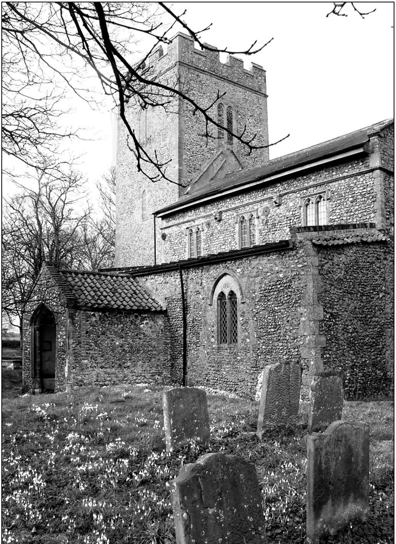
Photograph 1. Cockthorpe Church from the south-east in the early Spring with myriads of snowdrops flowering in the churchyard. Many interesting features are visible: the Porch, South Aisle, Clerestory and Tower with remnants of the old nave roofline showing.