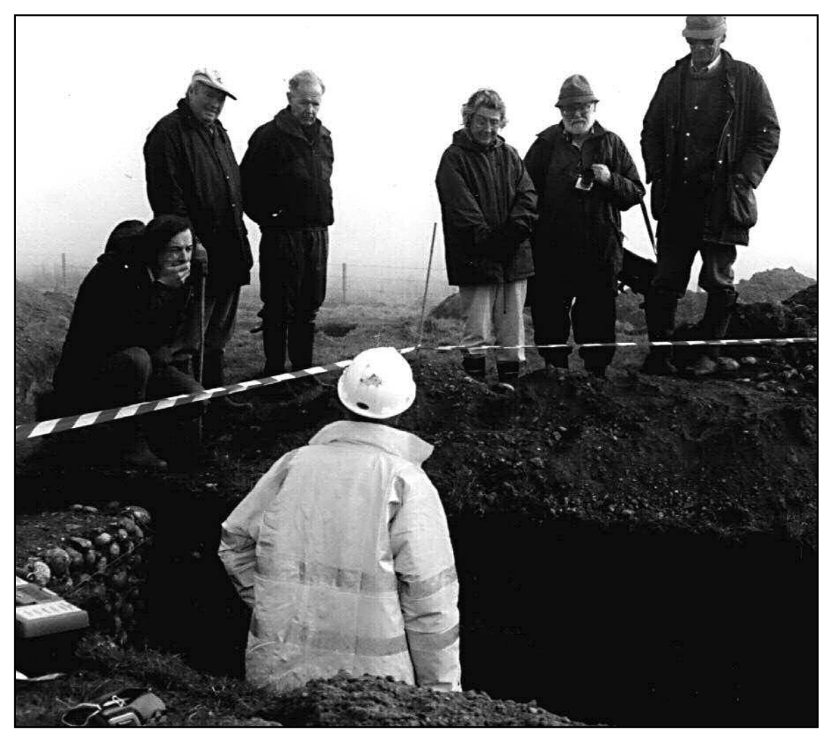
See page 70 for the nitty-gritty...