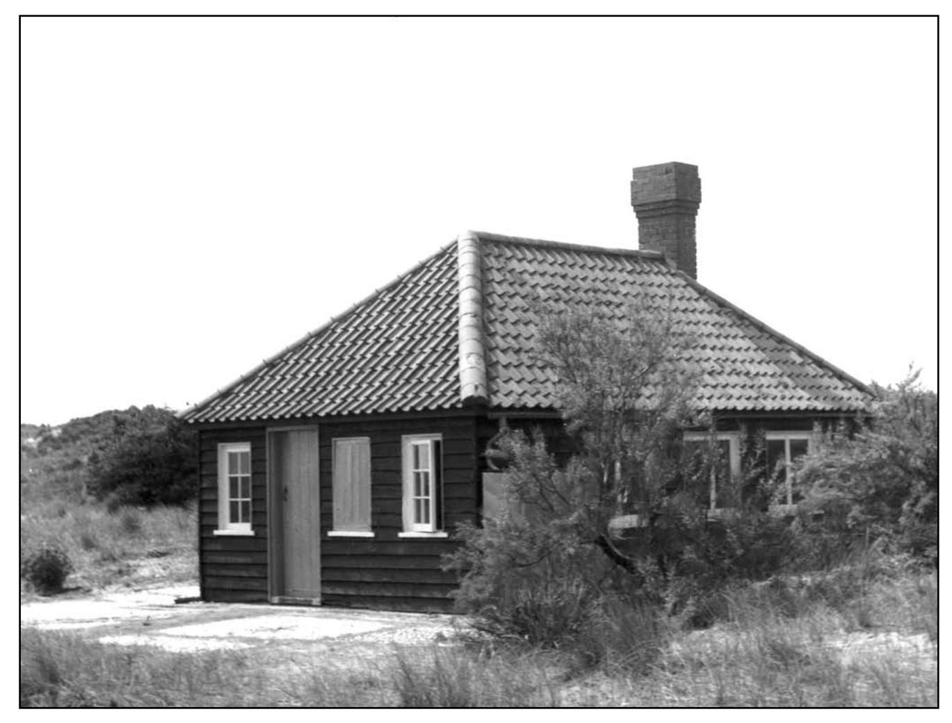
Photograph 1. The laboratory built just south of Glaux Low

Some idea of the amount of pioneer work achieved by Oliver and his associates may be gained by looking at the section on Maritime and Sub-maritime Vegetation (Chapters 40, 41 and 42) in Tansley's "The British Islands and their Vegetation" (1949).<sup>5</sup>