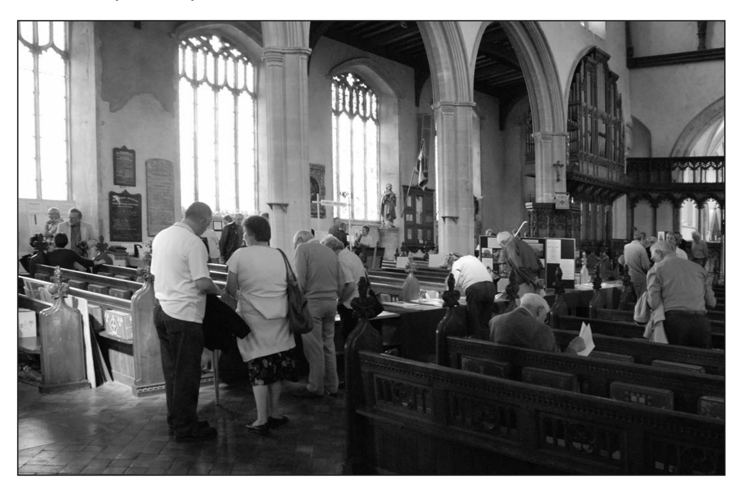
People everywhere! History Centre Open Day in St Nicholas Church. Every space within the nave and chancel was used for exhibits, while less crowded and quieter moments were found in the pews where there were over 50 folders covering a wide range of dfferent topics. See full report under History Centre (above).

ver the years, the History Centre has prepared several useful and inexpensive leaflets for helping researchers