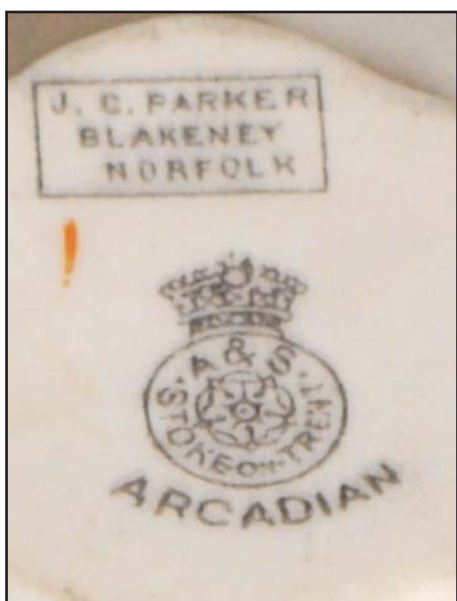
Photo 5: Base markings for Arcadian's Blakeney china sold by J C Parker.