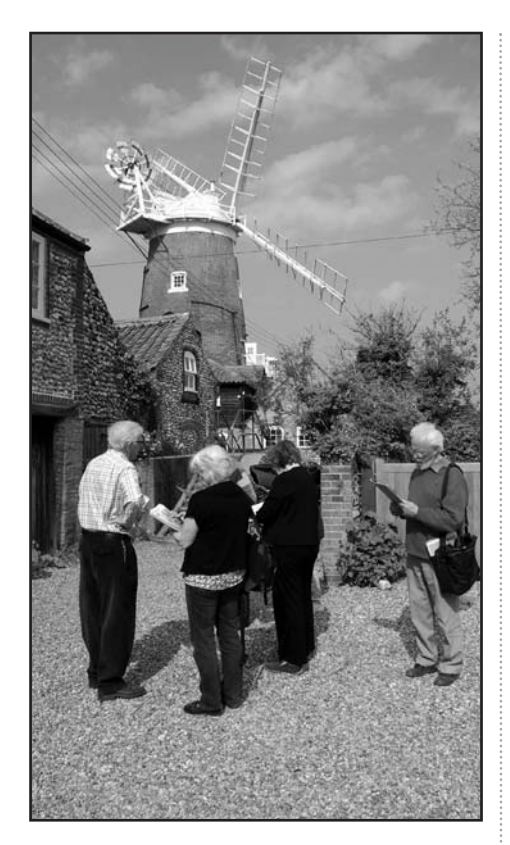
House detectives at work in Cley; investigating buildings built since the enclosure and those that have changed use and been adapted, to the widening of Public Road No 15.

Mayes families. These are now available for viewing in the History Centre.