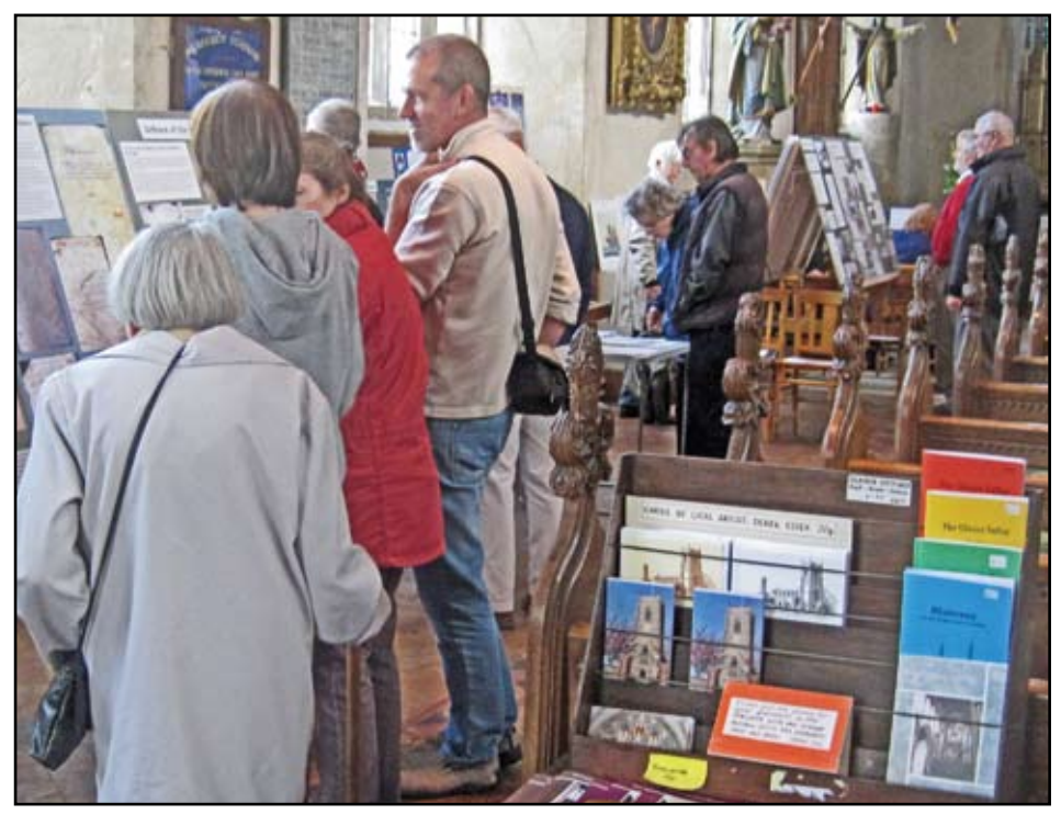
Ships Ahoy exhibition, 12-15 September, in the north aisle of St Nicholas, Blakeney.