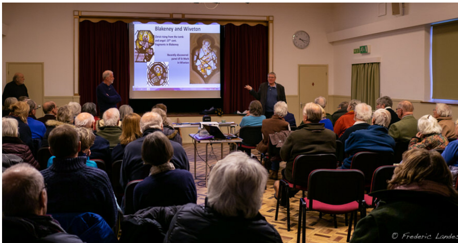
BAHS Meeting at Cley Village Hall January 2019

The option of holding a socially distanced meeting is not currently possible as meeting rooms and village halls remain closed. As a result the society reluctantly decided to arrange digital Zoom meetings as the only viable alternative during the rest of 2020. Thanks go to the speakers who have agreed to provide their lectures over Zoom.