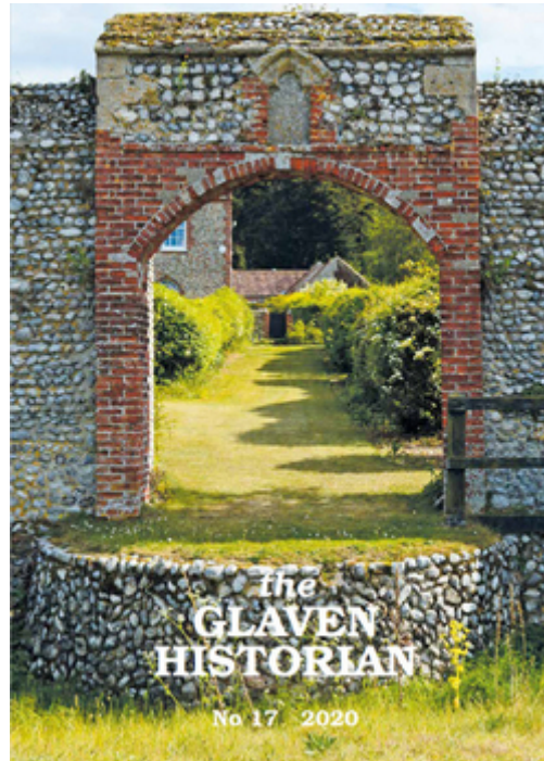
Glaven Historian 17 Cover

The seventeenth issue of the Glaven Historian, published on the thirtieth anniversary of the Blakeney Area Historical Society, has six papers on topics ranging from the medieval period to the twentieth century.